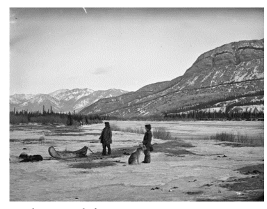
Looking North from Jasper House, 1872