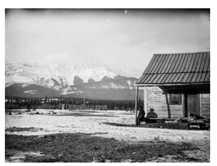
Jasper House Valley, 1872